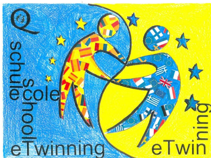
This flag was created by one of our students, to illustrate the school's involvement in eTwinning projects, in a contest we organized in 2011-2012.

- A “language studio” has recently been created, to run videoconference exchanges with partner schools.